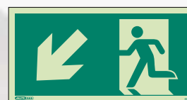
4980G, 4980L, 4980I, 4980W