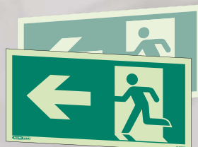
4343DSG, 4343DSI, 4343DSW