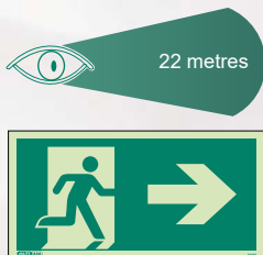
G size: 150 x 300mm