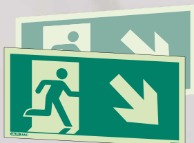
4979DSG, 4979DSI, 4979DSW