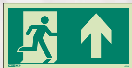
4973G, 4973L, 4973I, 4973W