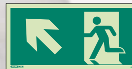
4978G, 4978L, 4978I, 4978W