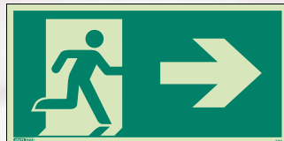
I size: 200 x 400mm