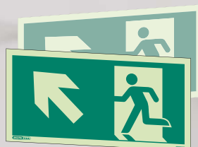
4978DSG, 4978DSI, 4978DSW