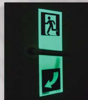
Jalite sign under power loss conditions