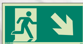
4979G, 4979L, 4979I, 4979W