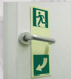
Jalite sign under normal lighting conditions