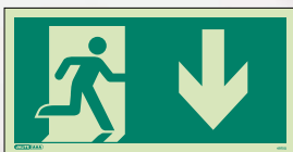
4975G, 4975L, 4975I, 4975W