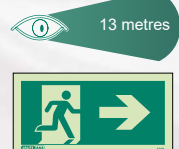
L size: 100 x 200mm

The following examples show the difference in sizes for JALITE International Way Guidance signs and a recommended viewing distance when illuminated at 100 lux for each size.