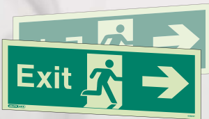
405DST, 405DSK, 405DSJ