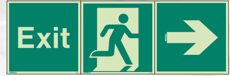
QQQ size: 300 x 900mm