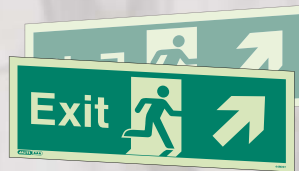
449DST, 449DSK, 449DSJ